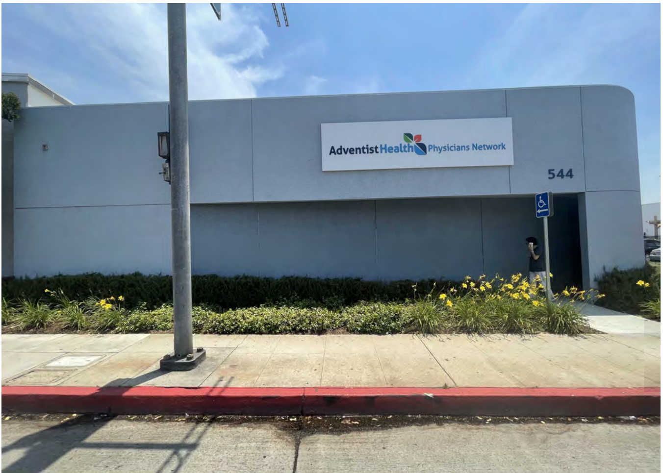
4. 544 N GLENDALE AVE