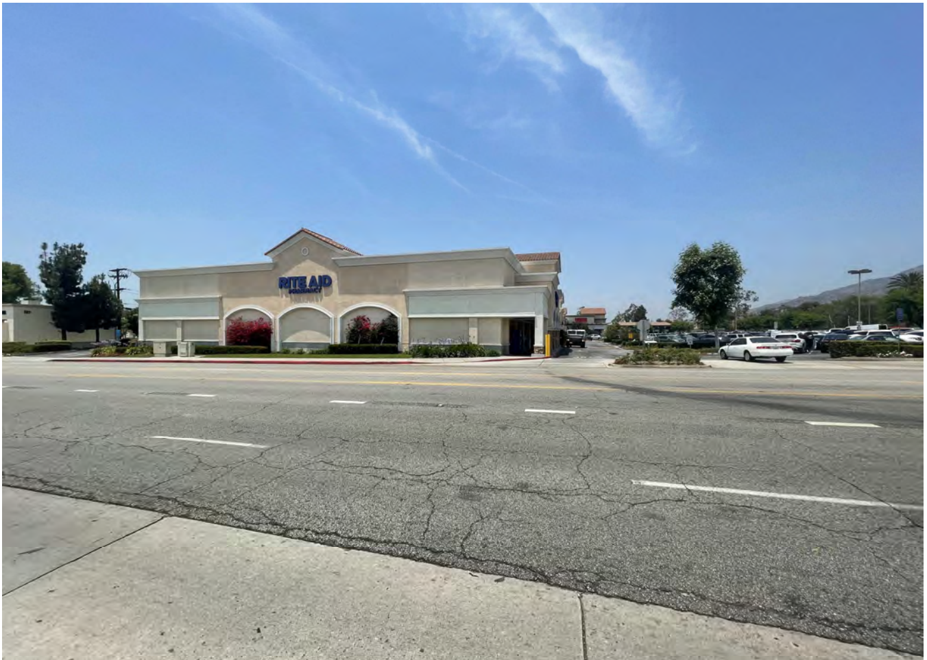
7. 531 N GLENDALE AVE