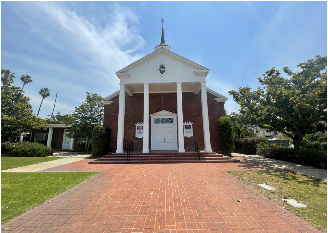
6. 604 N GLENDALE AVE