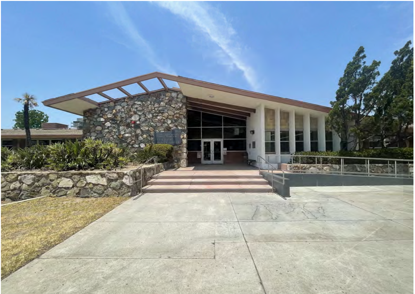
14. 501 N GLENDALE AVE (VIEW FROM GLENDALE AVE)