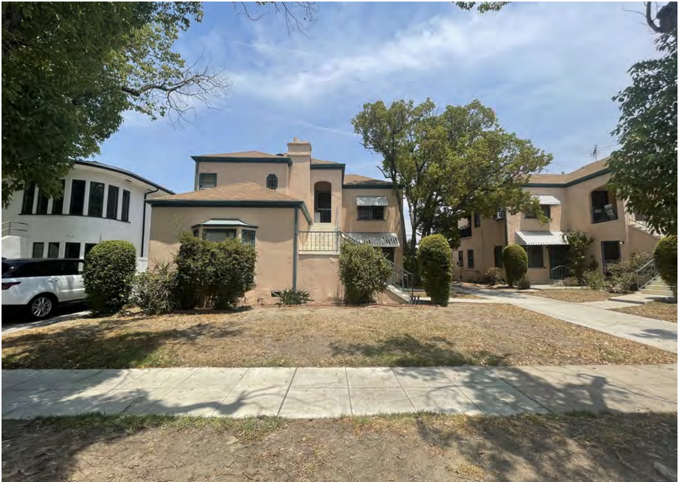
11. 817 E DORAN ST