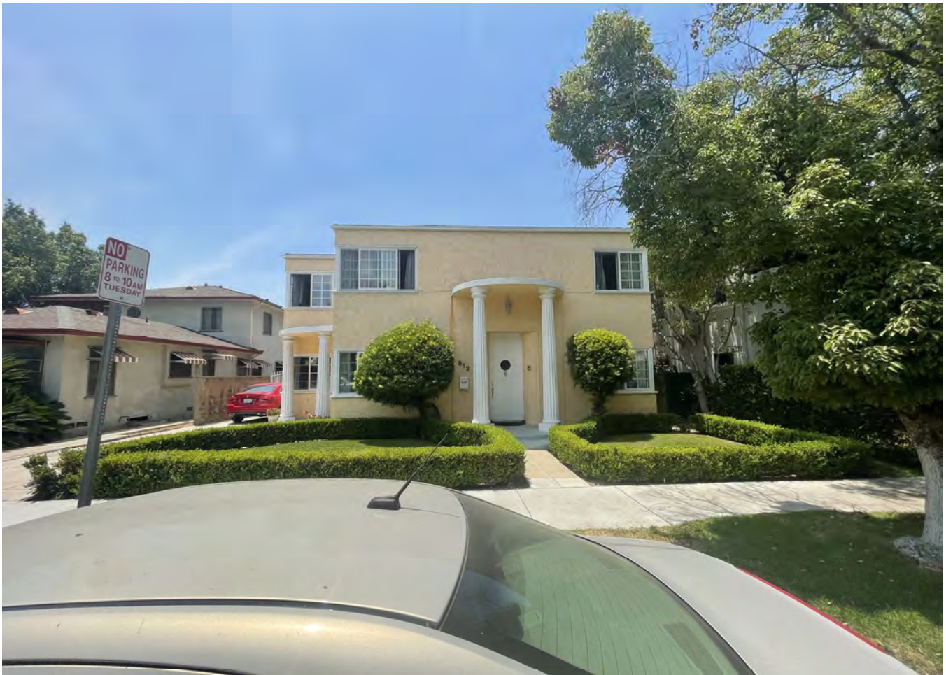
12. 812 E DORAN ST