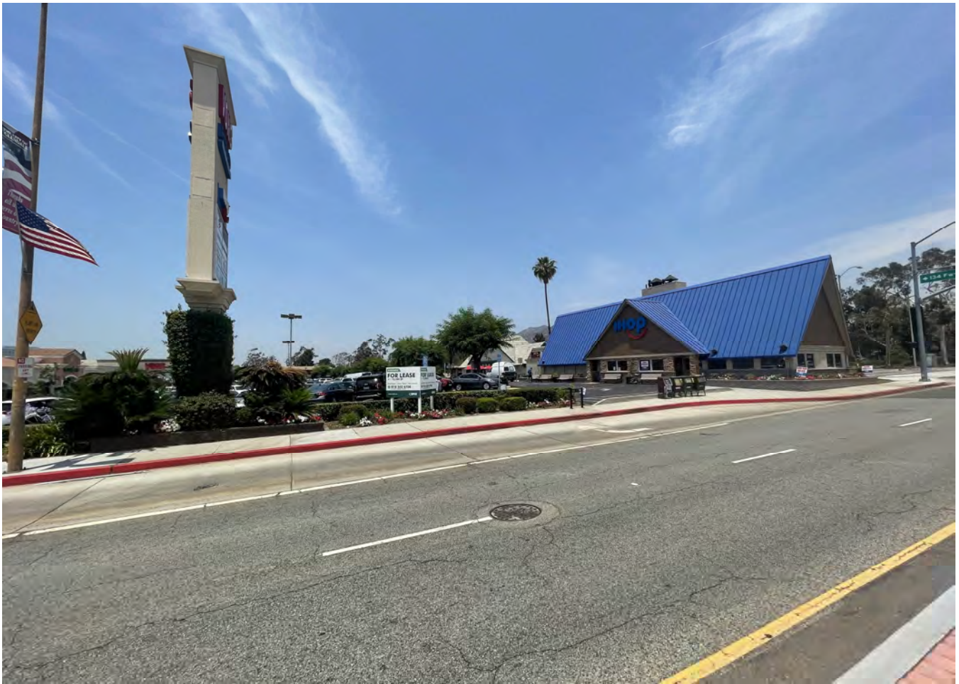
7. 531 N GLENDALE AVE