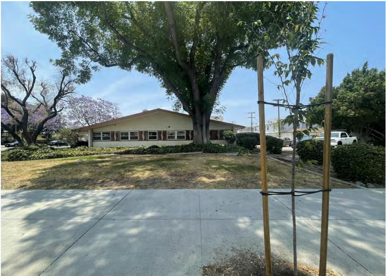
14. 501 N GLENDALE AVE (VIEW FROM DORAN ST)