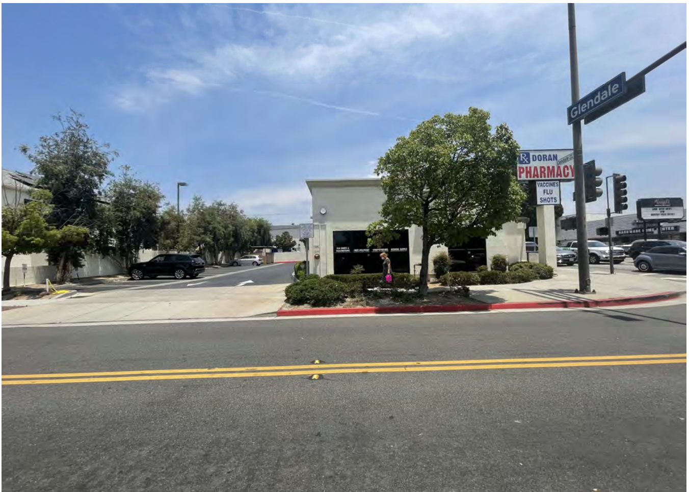
8. 525 N GLENDALE AVE (VIEW FROM DORAN ST)