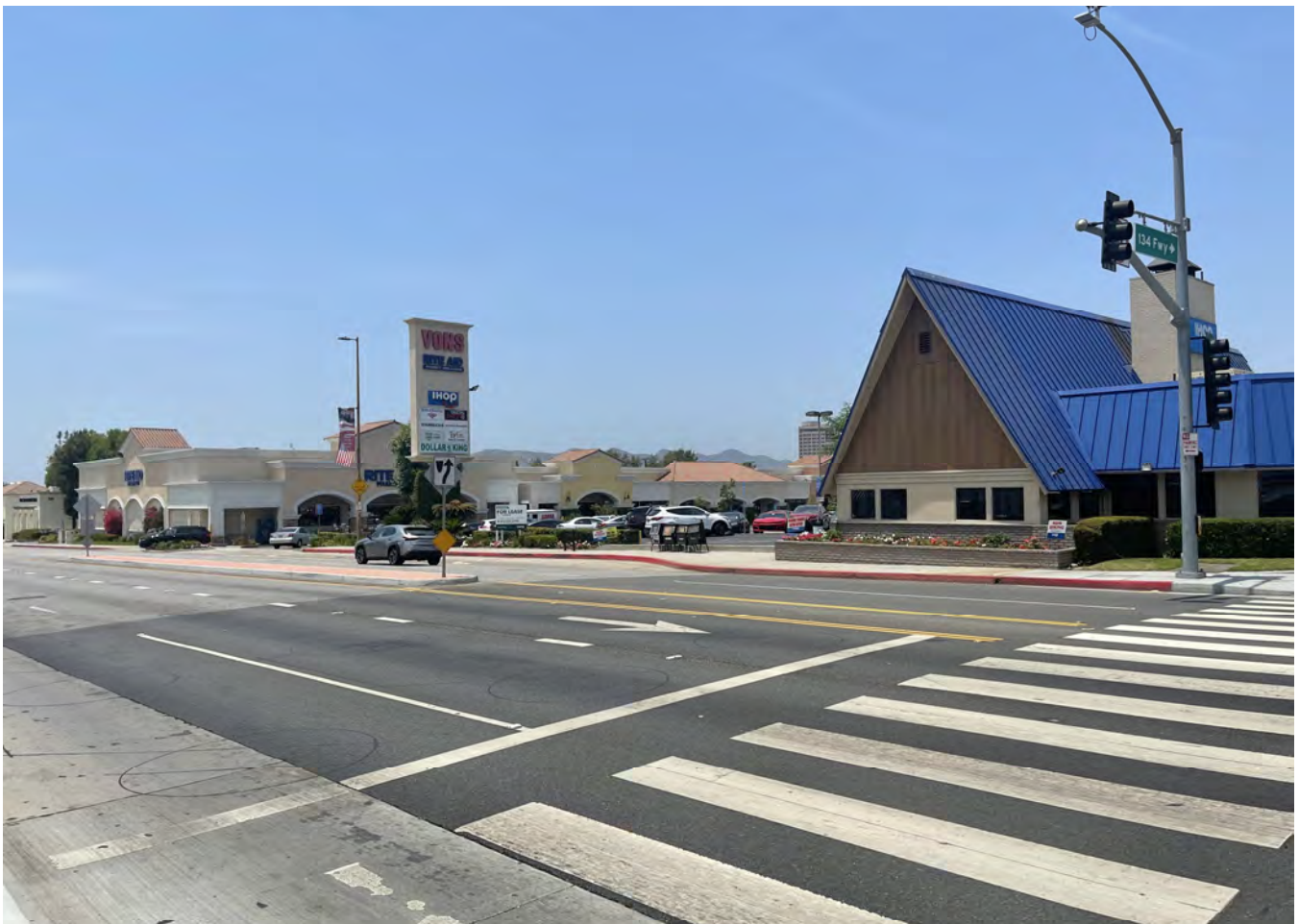
7. 531 N GLENDALE AVE