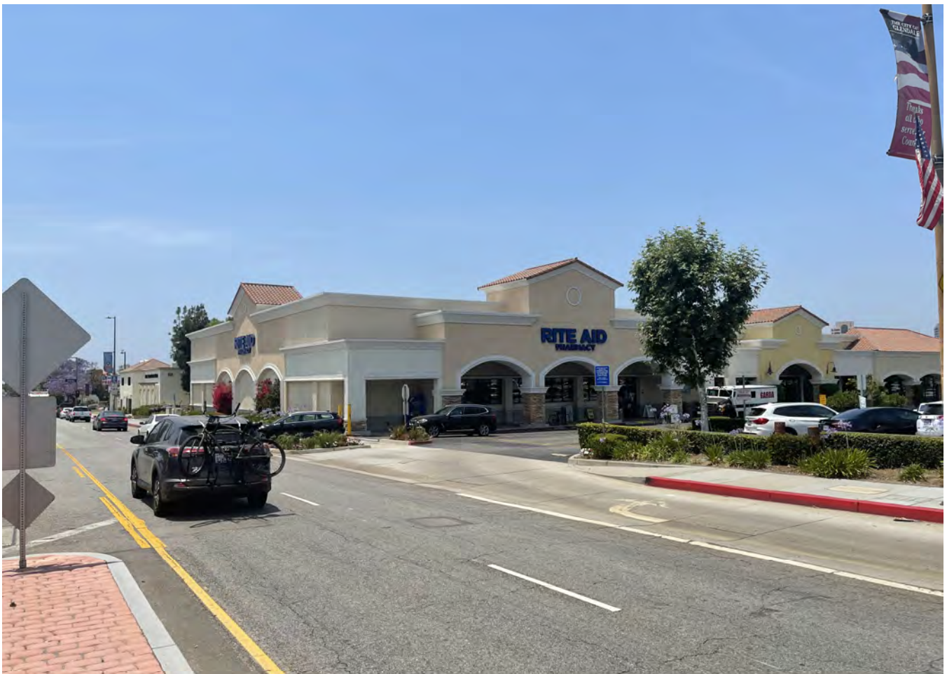
7. 531 N GLENDALE AVE