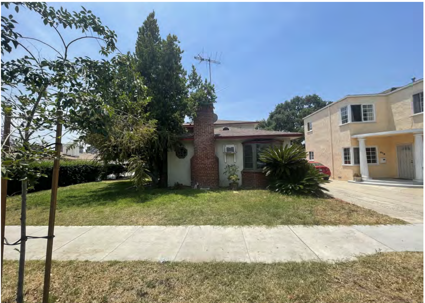
13. 816 E DORAN ST