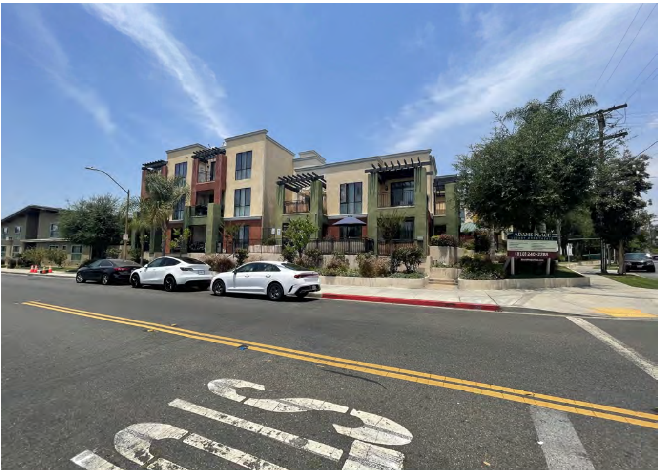
19. 525 N ADAMS ST