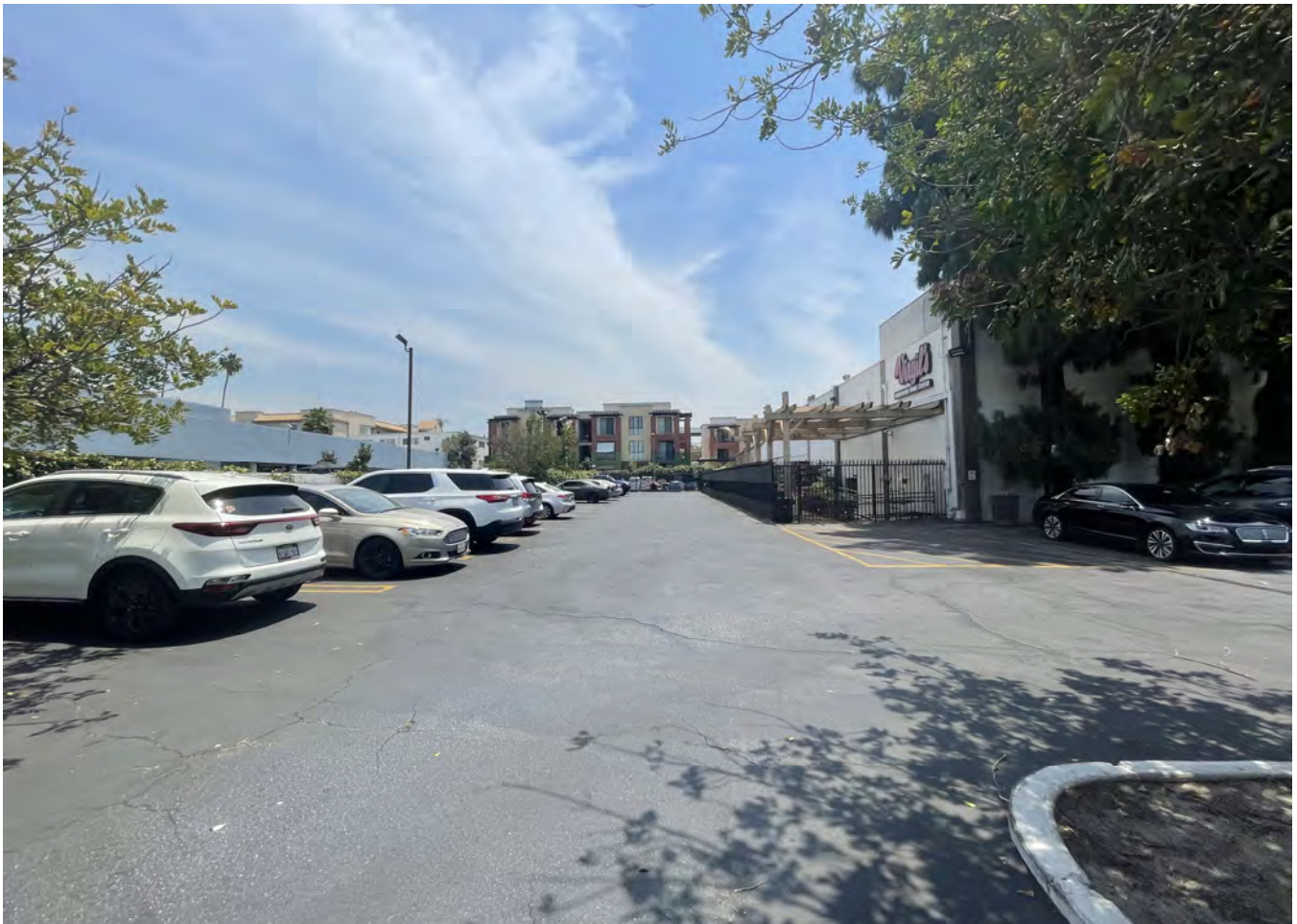
2. 534 N GLENDALE AVE