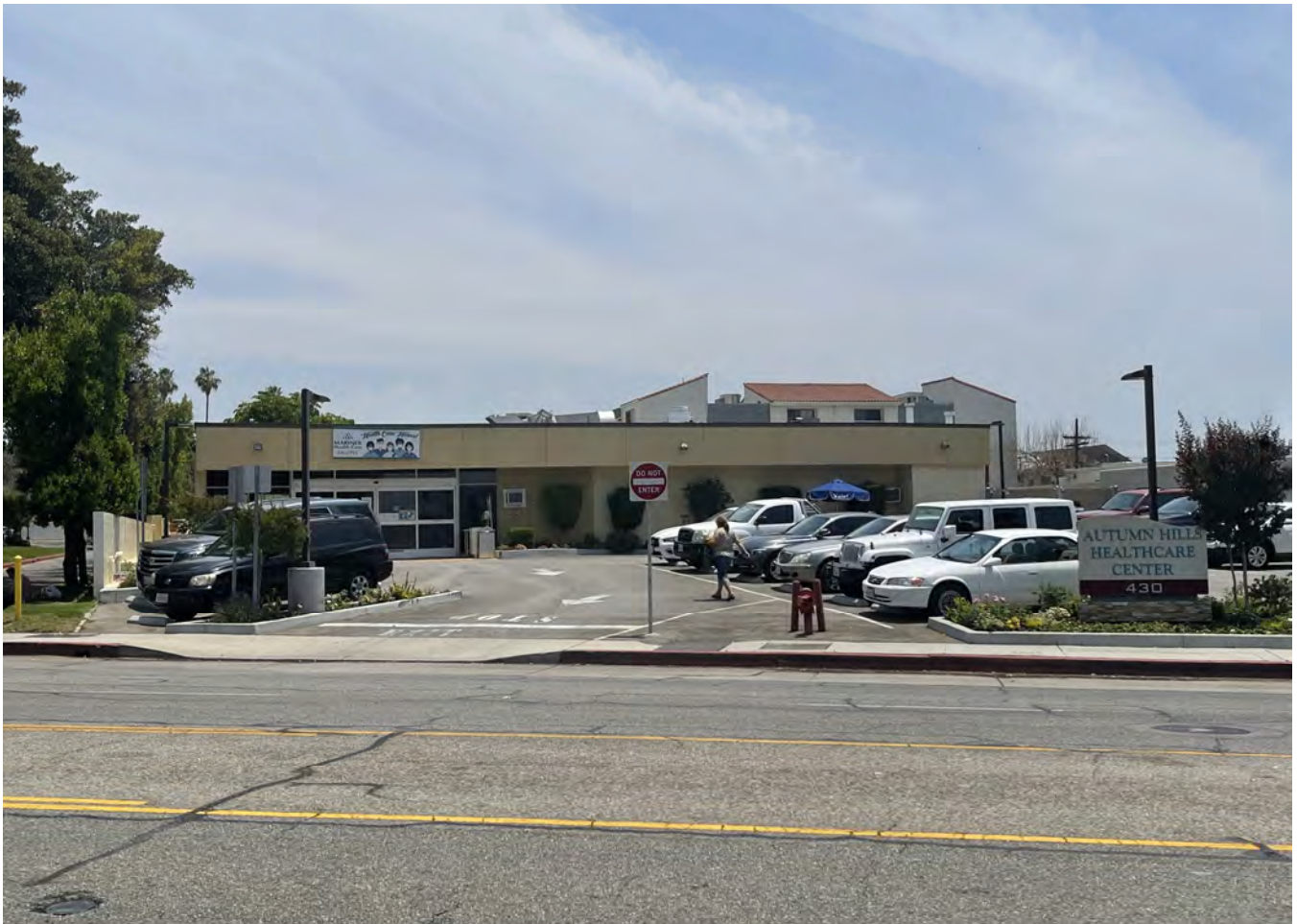
15. 430 N GLENDALE AVE