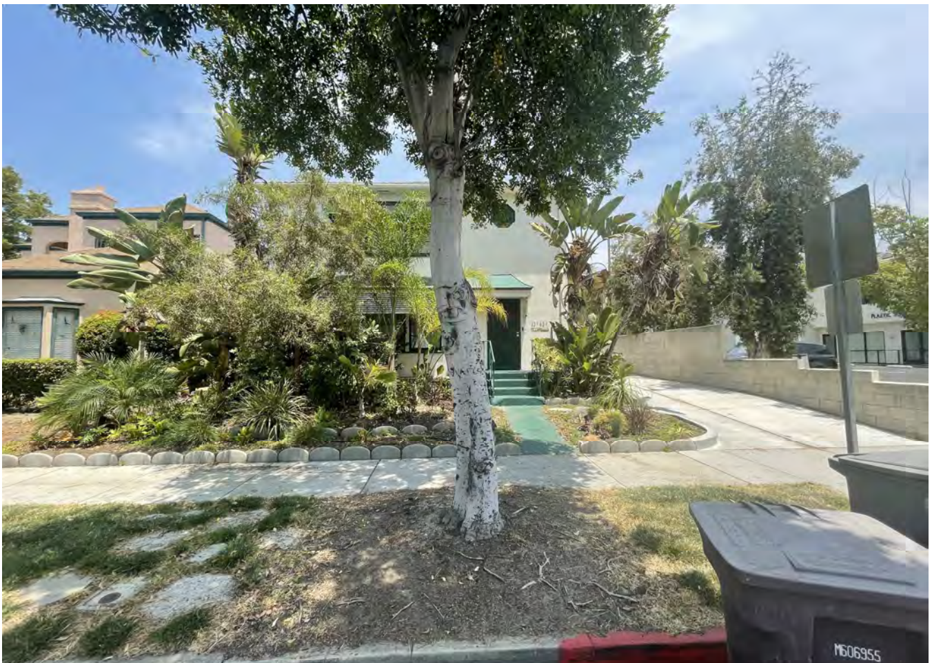
9. 827 E DORAN ST