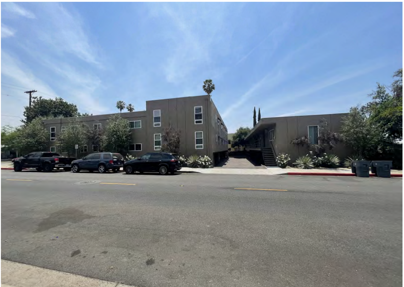
17. 505 N ADAMS ST