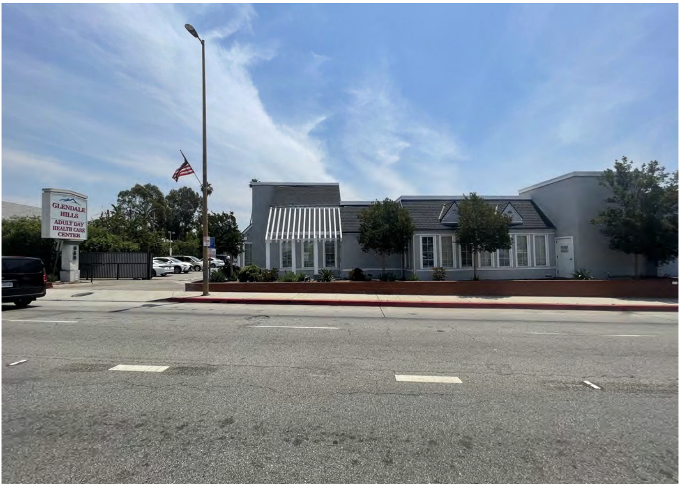
5. 550 N GLENDALE AVE