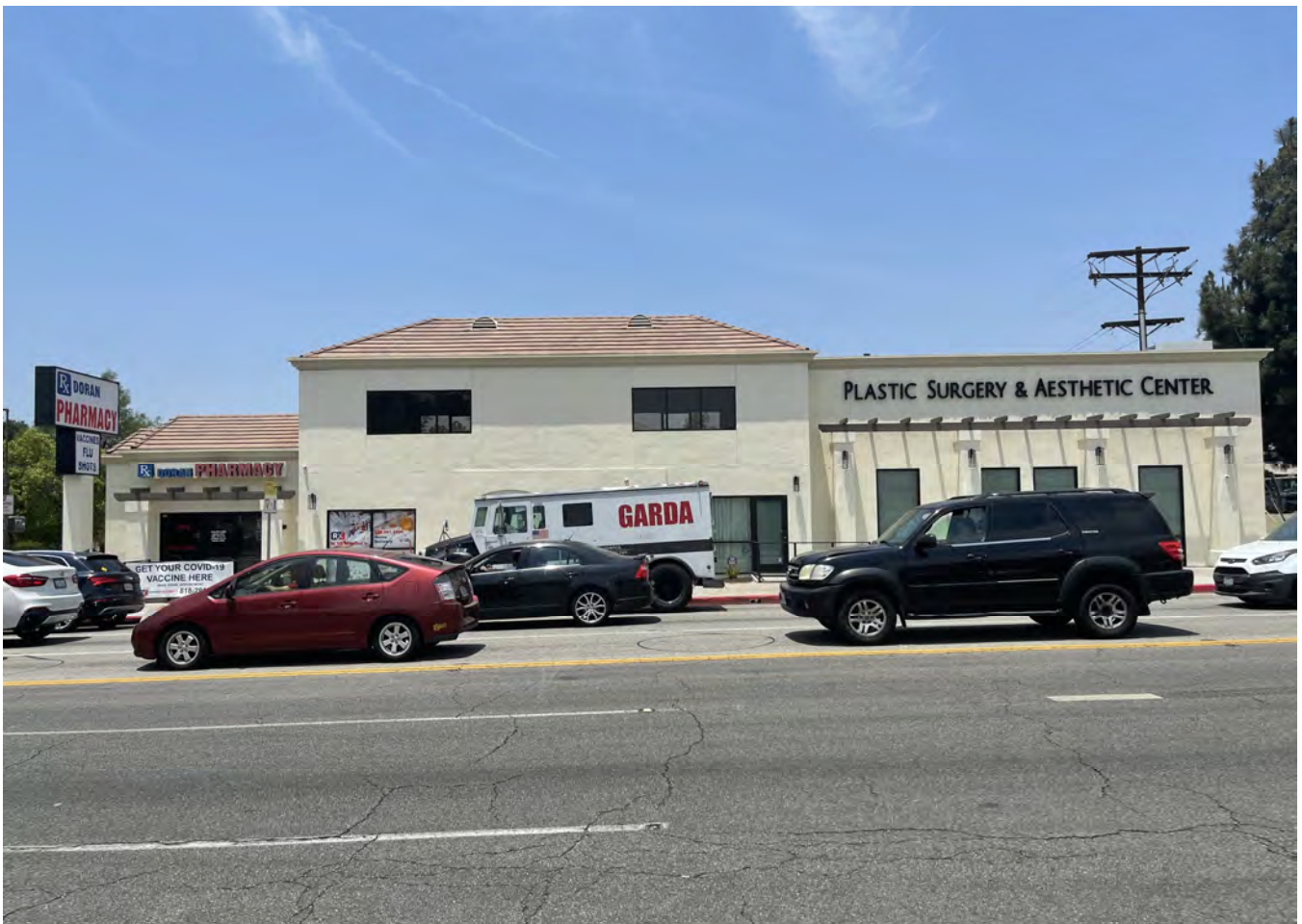
8. 525 N GLENDALE AVE (VIEW FROM GLENDALE AVE)