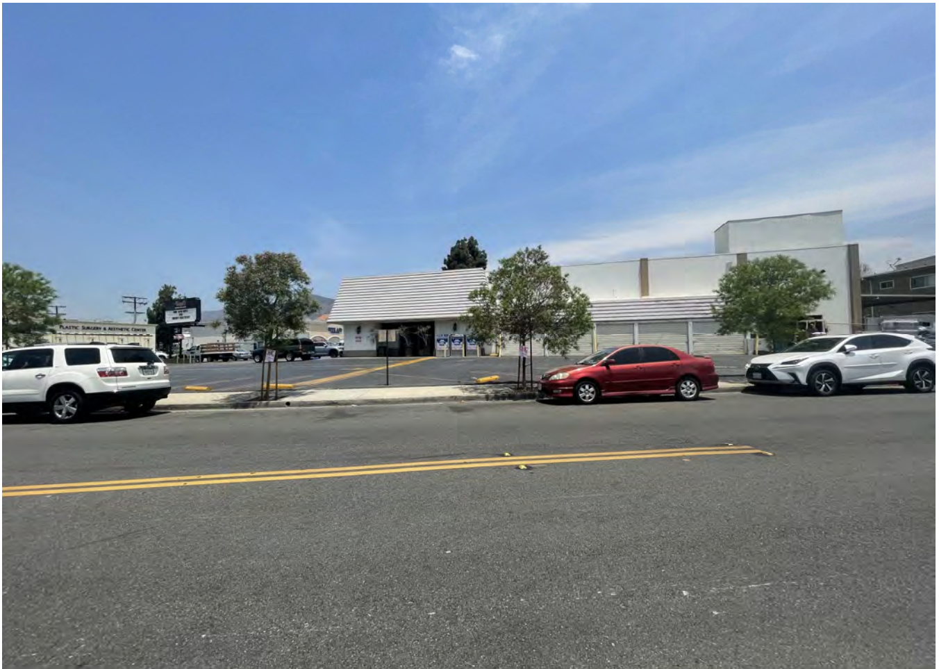
1. 901 E DORAN ST (VIEW FROM DORAN ST)