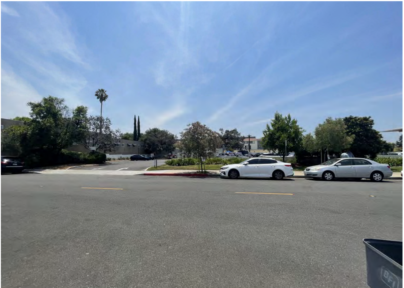
16. 500 N GLENDALE AVE (VIEW FROM DORAN ST)