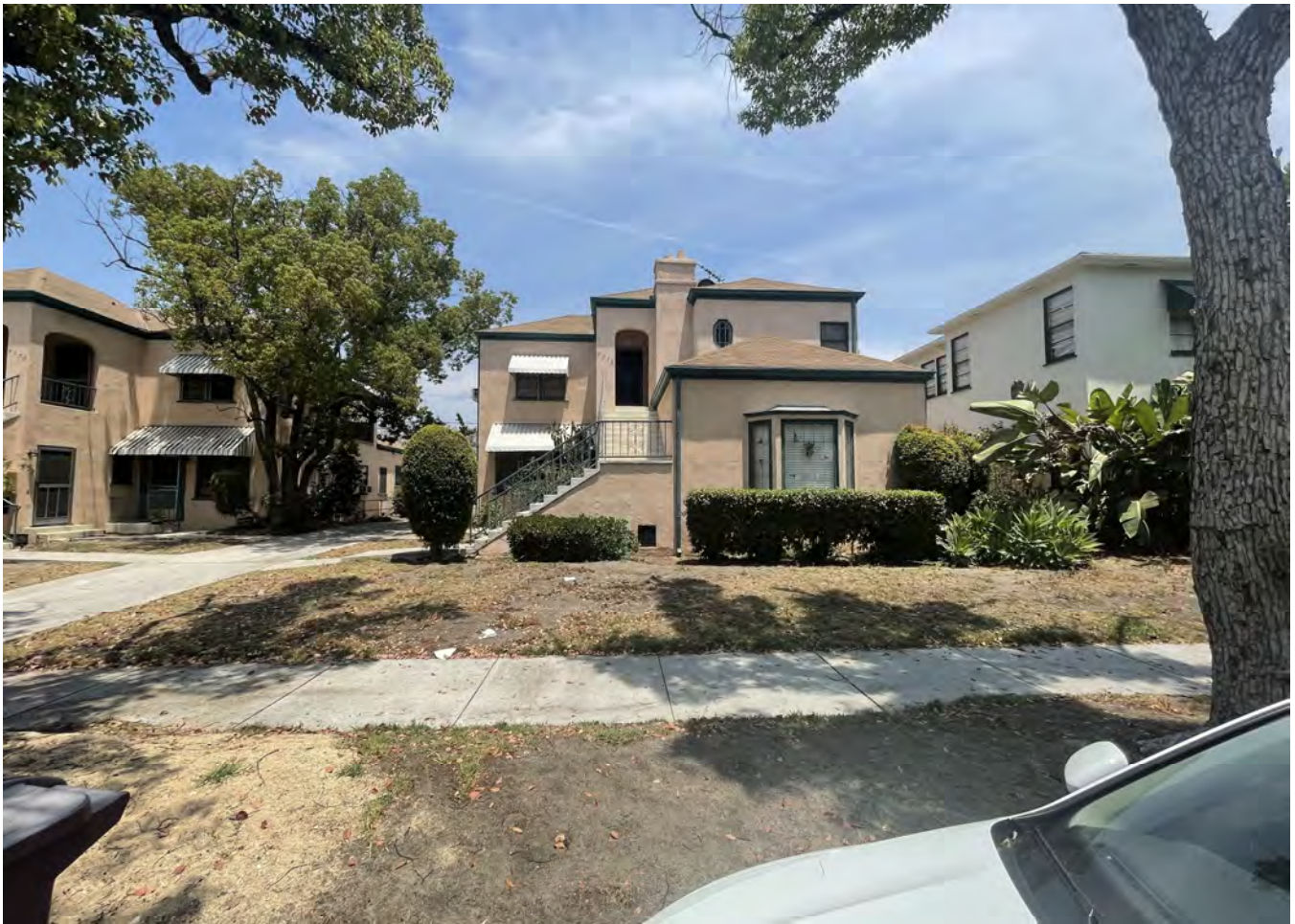
10. 821 E DORAN ST