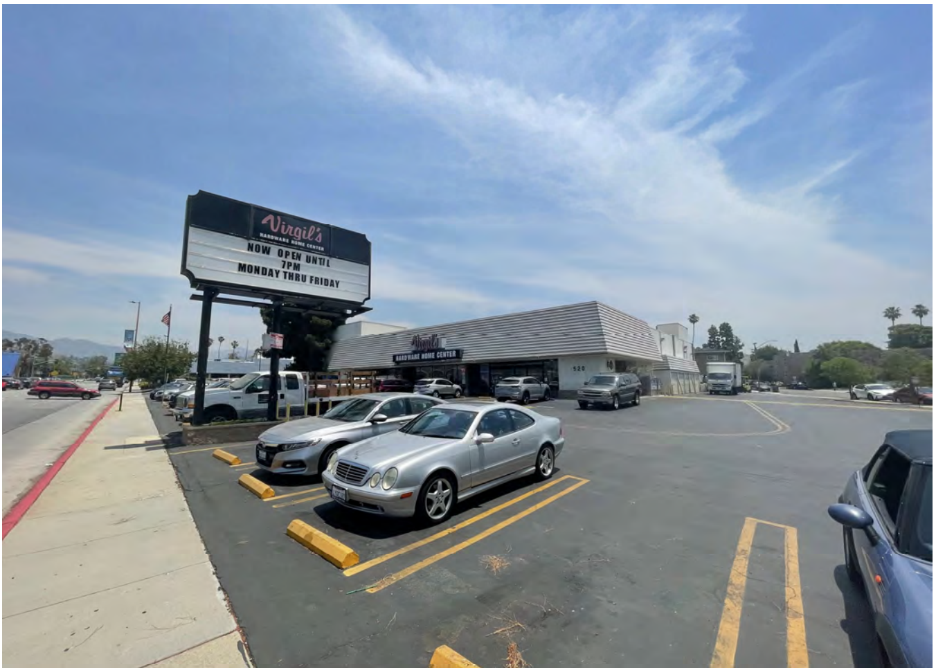
1. 901 E DORAN ST (VIEW FROM CORNER OF DORAN ST & GLENDALE AVE)