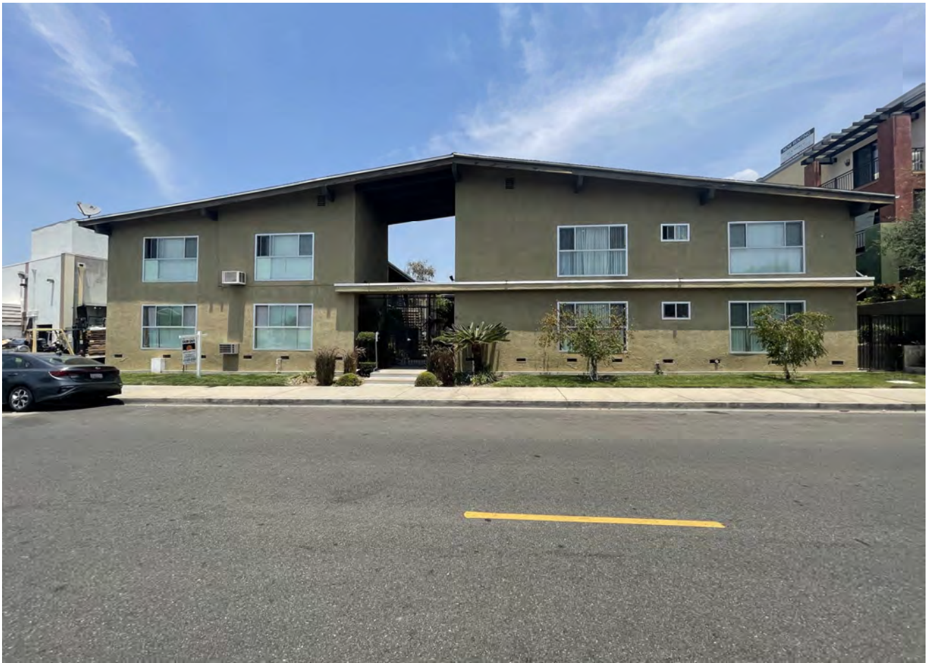
20. 1005 E DORAN ST