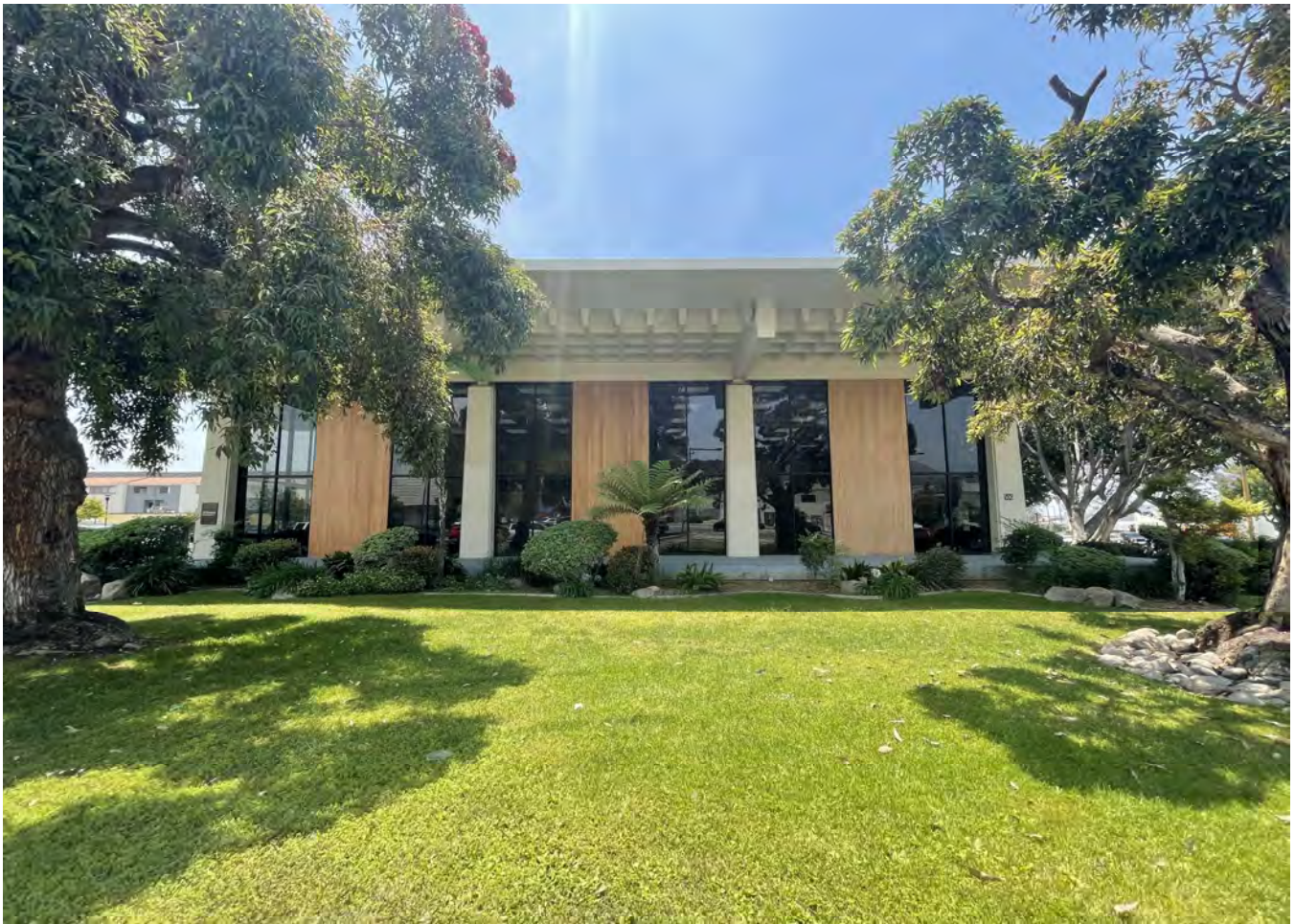
16. 500 N GLENDALE AVE (VIEW FROM DORAN ST)