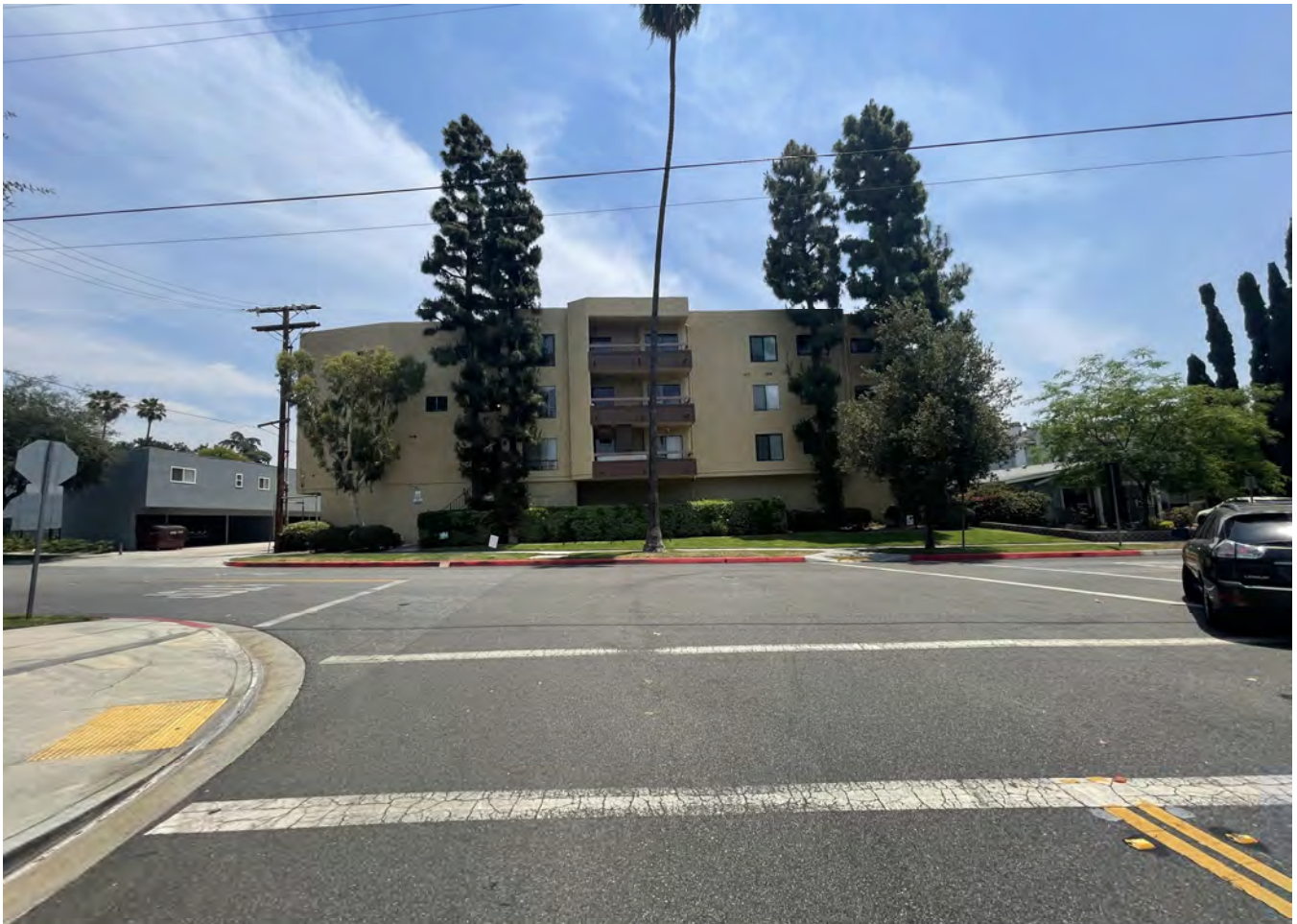
18. 444 PIEDMONT AVE