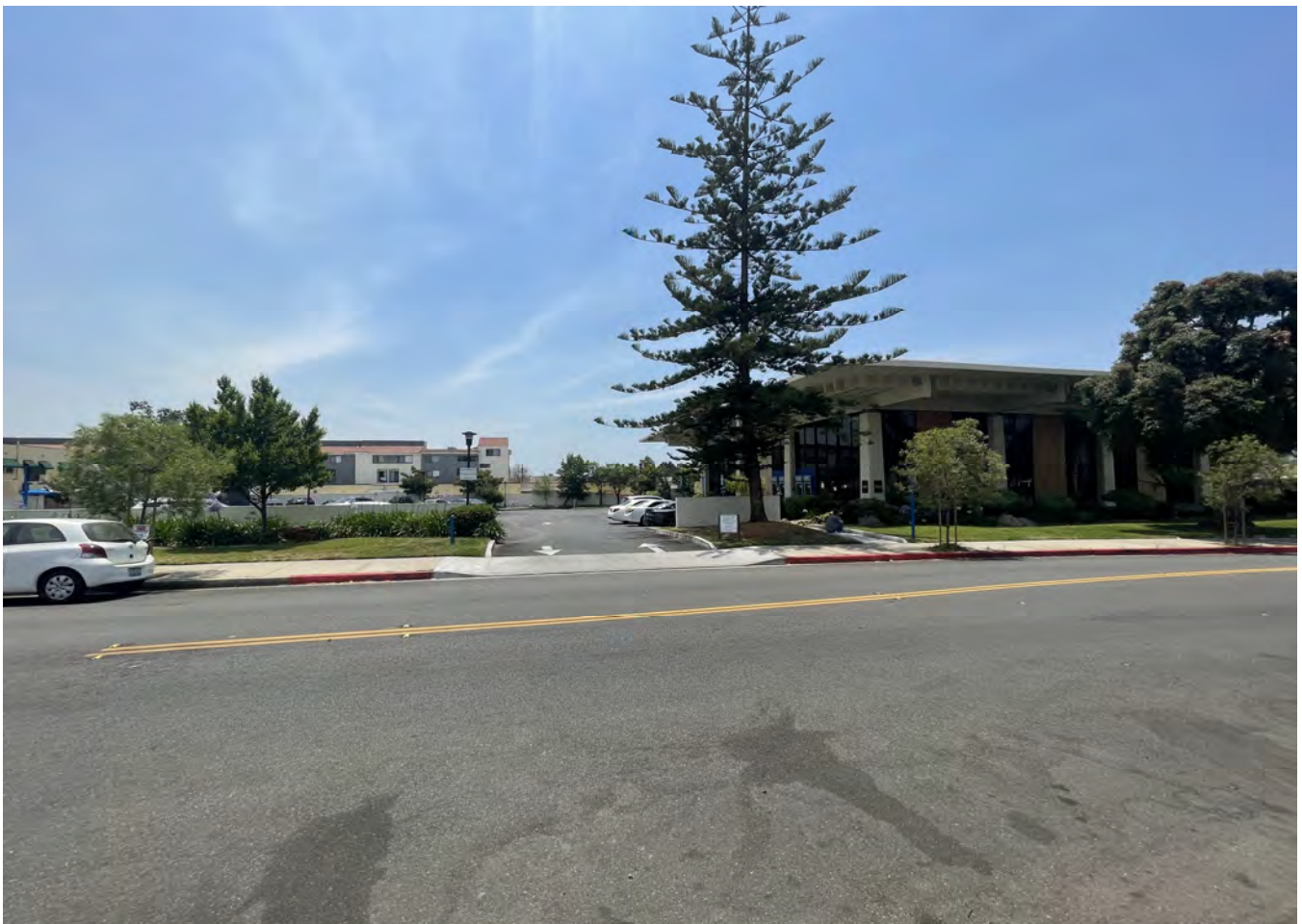
16. 500 N GLENDALE AVE (VIEW FROM DORAN ST)