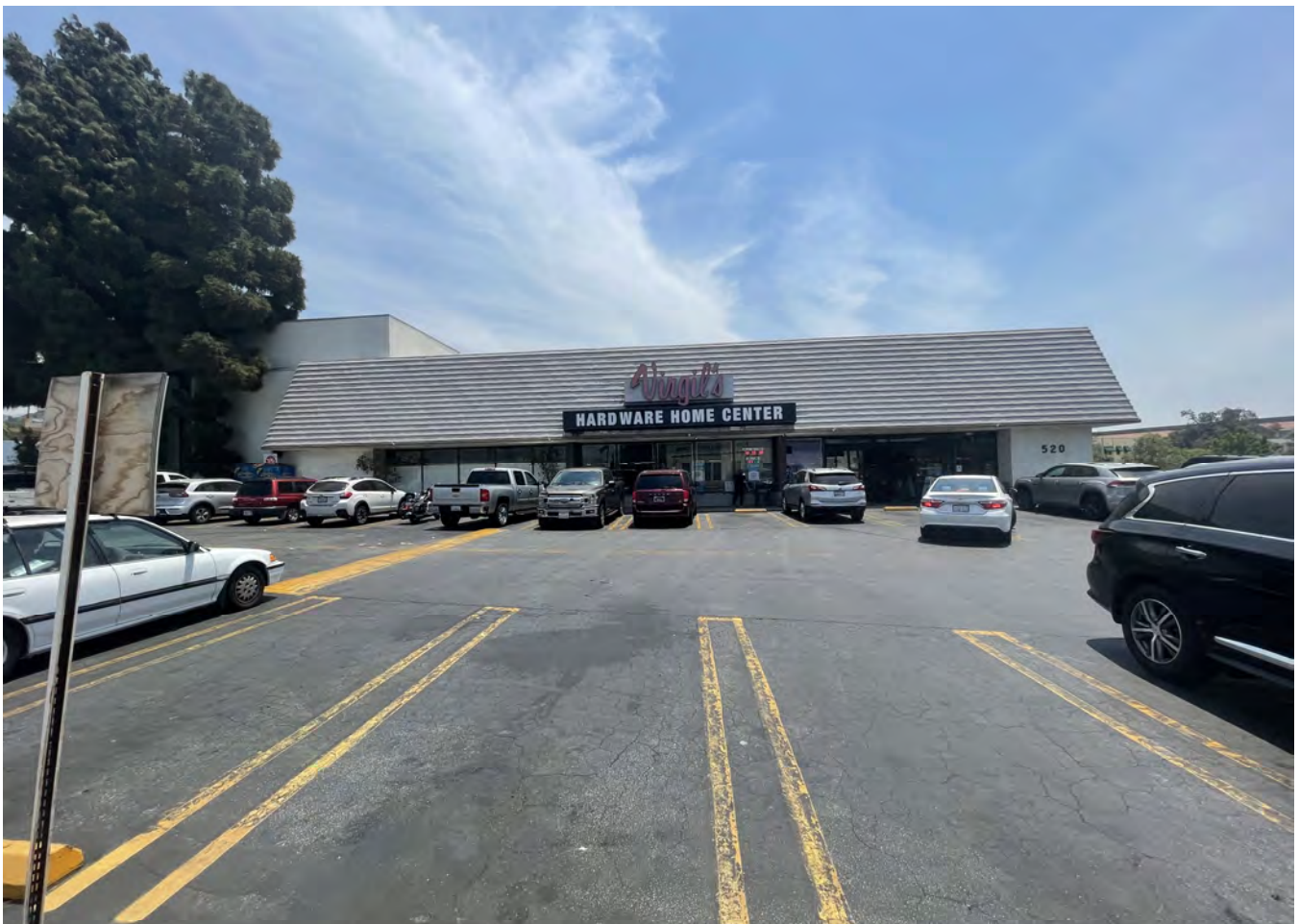
1. 901 E DORAN ST (VIEW FROM GLENDALE AVE)