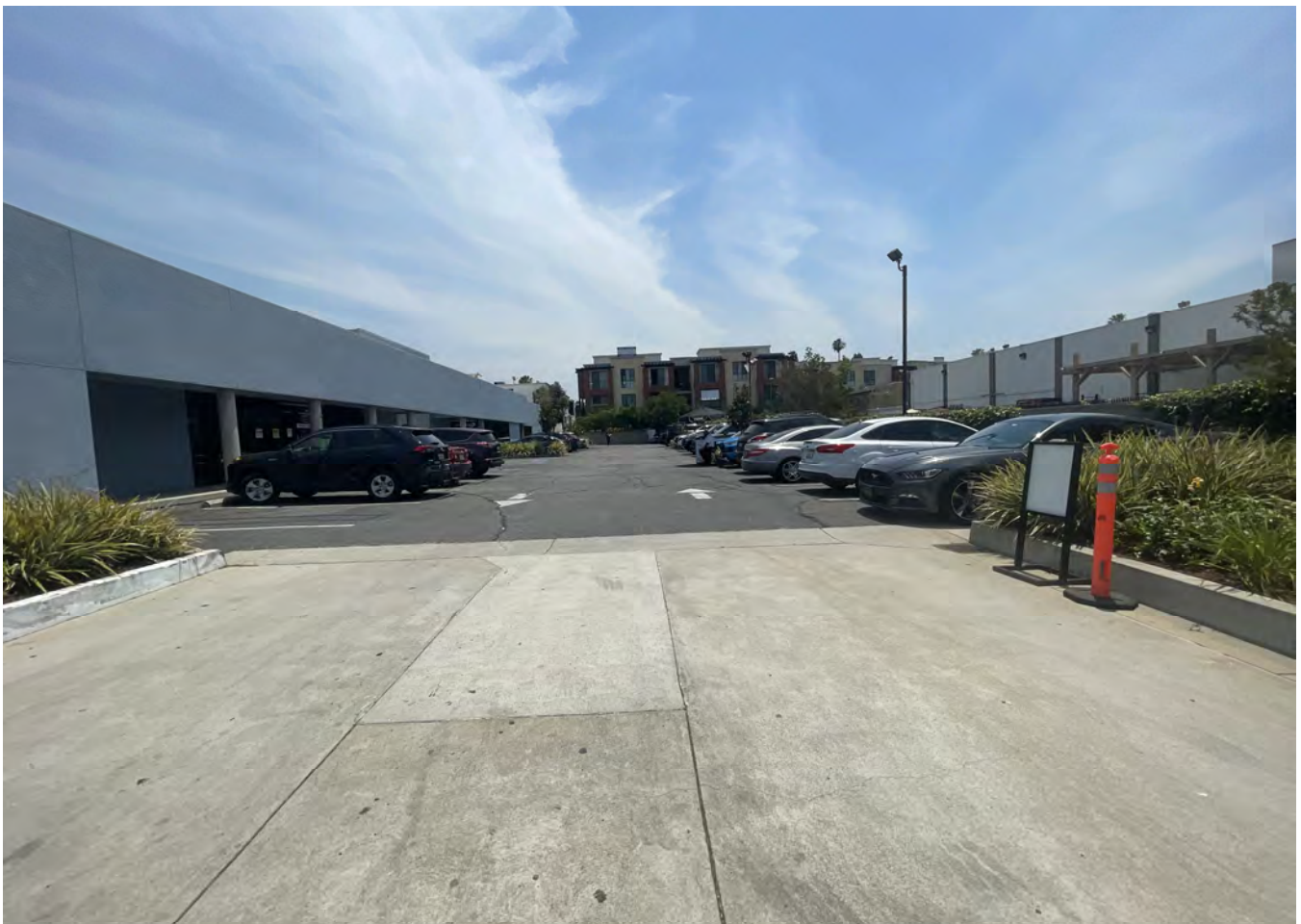
3. 542 N GLENDALE AVE