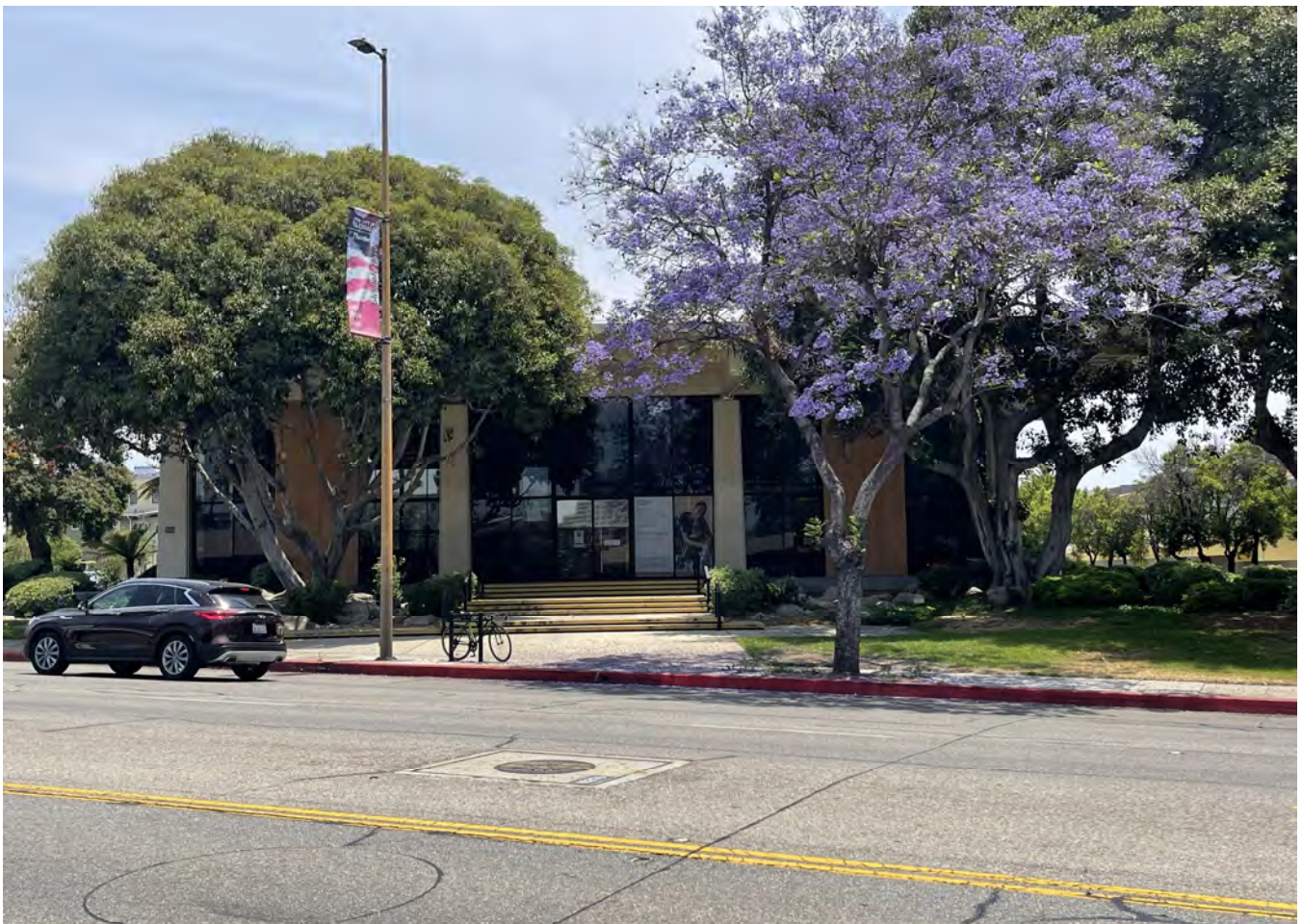
16. 430 N GLENDALE AVE (VIEW FROM GLENDALE AVE)