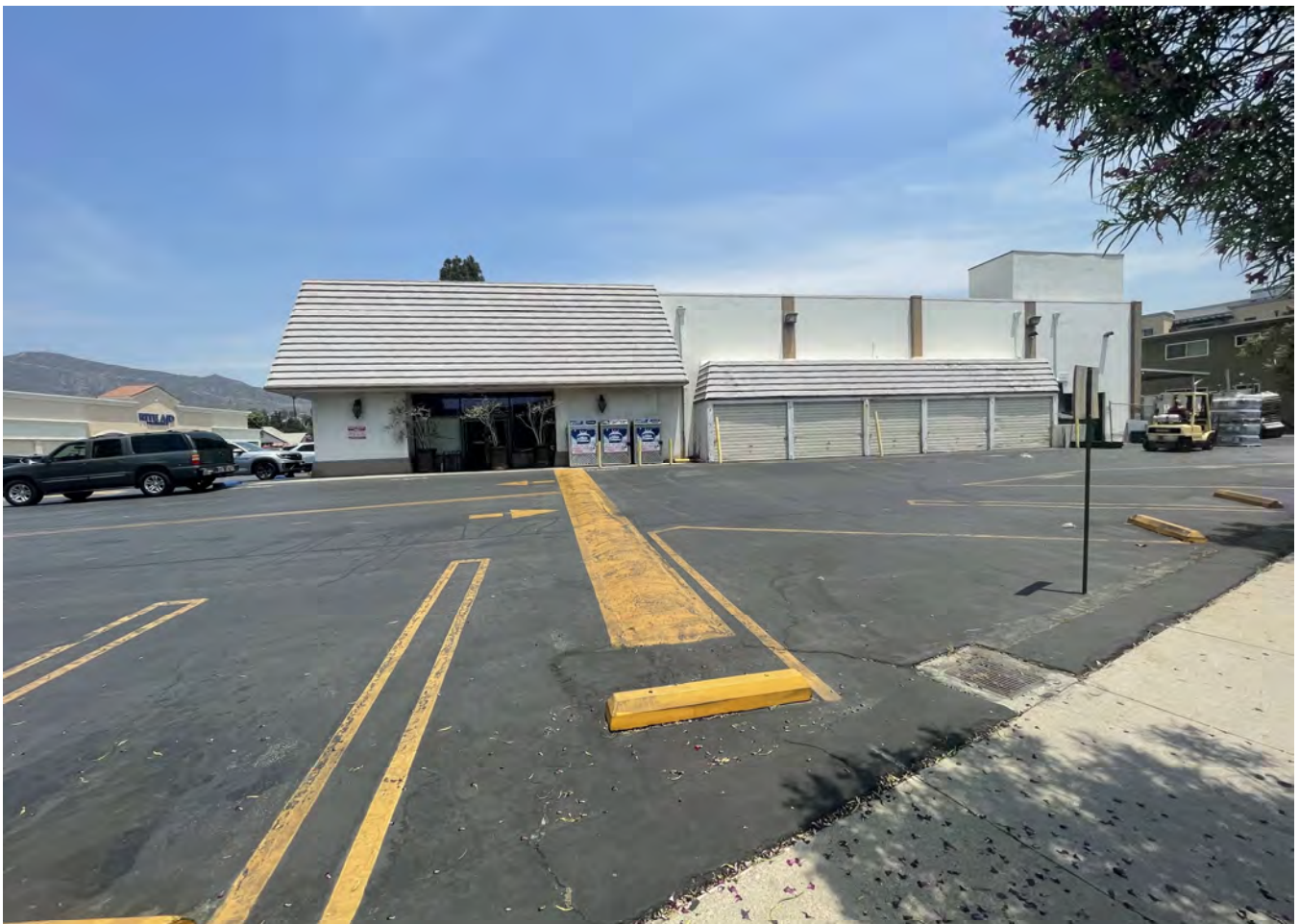
1. 901 E DORAN ST (VIEW FROM DORAN ST)